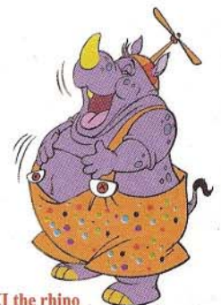
RIKI the rhino

PARK: P. O. B. No. 19710, ESSELWORLD, GORAI VILLAGE, BORIVALI (W), MUMBAI - 400 091. ☎: 91-22-869 9957, 869 3321, 869 0322 / 23 / 24. FAX: 91-22-869 7331 E-mail: esselwor@bom3.vsnl.net.in